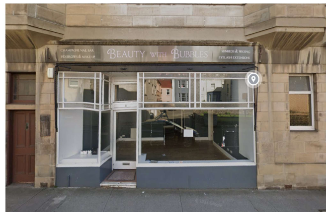
Figure 2: Now - 2024