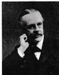
Arthur J. Balfour Prime Minister, 1900-1905