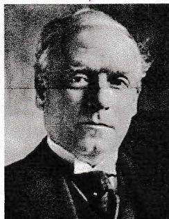
Herbert Henry Asquith Prime Minister, 1908-16